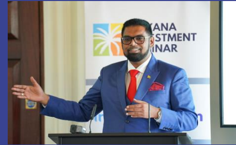
His Excellency Dr Mohamed Irfaan Ali, President of Guyana