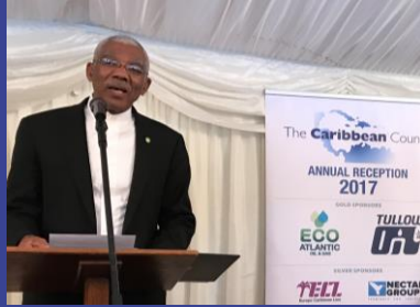
The Hon. David Granger, Former President of Guyana