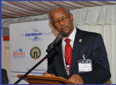
The Hon. David Smith, OBE, Former Premier and Minister of Finance of the Virgin Islands