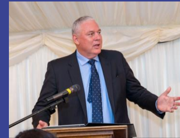
The Hon. Allen Chastanet, Former Prime Minister of St Lucia