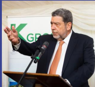
The Hon. Dr Ralph Gonsalves MP, Prime Minister of St Vincent and Grenadines