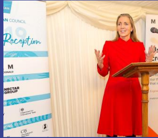
Baroness Fairhead CBE, Former Minister of state for Trade & Export Promotion, DIT, UK Government